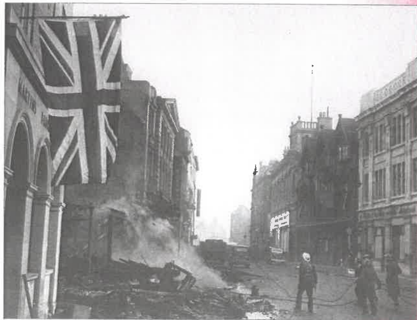
Our High Street Offices Survive the 1940 Blitz.

We are proud of our heritage as a firm which has played a significant part in the development of Coventry.