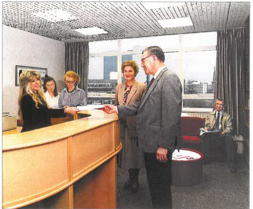
"Personal and individual care and attention"

At the same time, we are sufficiently compact to ensure a high degree of personal contact and involvement at Partner and Senior Executive level. We place great emphasis upon building a good personal relationship with our clients, and ensuring that we are accessible and responsive to their needs.